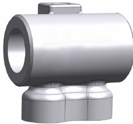
Length: 3.7 in (94 mm)

It allows multiple bottles to be connected to a common piping network. They are installed with check valves (VALAN-20A / VALAN-21A / VALAN-15CO / VALAN-15CO-VF) to prevent gas from escaping to atmosphere should any of the bottles not be connected to the manifold. The distributor will have an external finish, zinc coated or coloured in red.